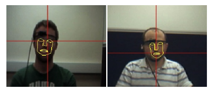
Fig. 3. A timestep of interaction showing the face tracking and gaze direction data for a conversation pair for both of the participants' corresponding video frames. This corresponds to a high level behavioral state used for analysis (in this example, the Mutual Gaze state).

any topics they liked during their conversation. In case they could not think of a topic, a list of "ice breakers" was provided. These suggested conversation topics included: hobbies, a recent vacation, restaurants, television shows, or movies.