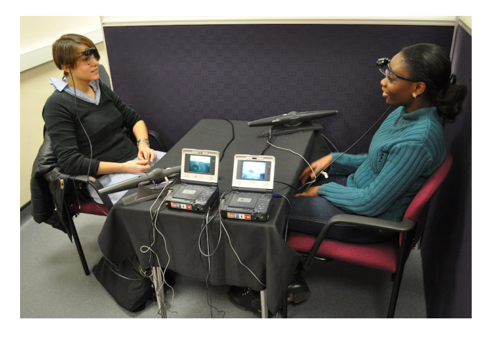
Fig. 2. Experimental setup for the conversation pairs.